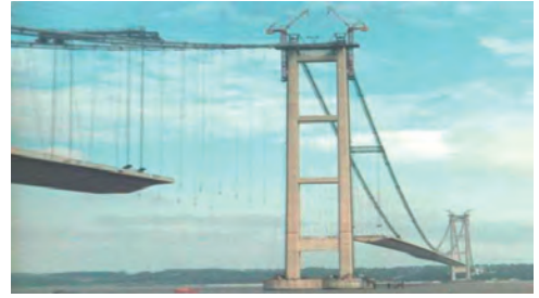
Fig. 1: (a) Cross section of a streamlined long-span suspension bridge with flutter suppression winglets. (b) Humber Bridge during erection.