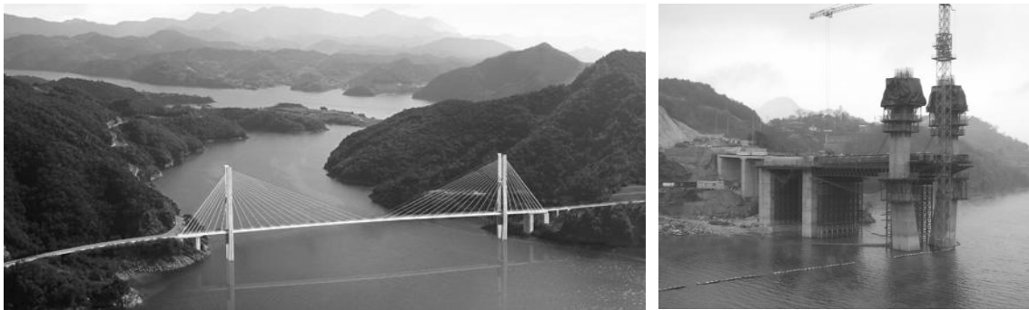
Fig. 2: 'Cheong Poong' bridge.

It is now under construction and expected to open to traffic at year of 2009. The 'Cheong Poong' cable-stayed bridge would play a role of symbolic landmark for the tourism development in Chungcheong province, Korea, as well as of transportation by replacing the existing concrete girder bridge.